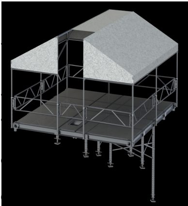
ADJUSTABLE PLATFORM TO OVERCOME EXTREMELY UNEVEN GROUND